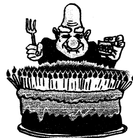
Tener ochenta años