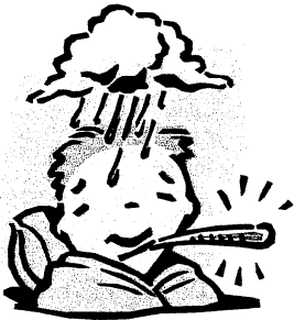
Tener la gripe